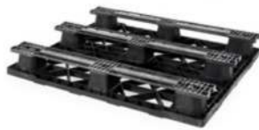
> 3 runners (3R)