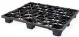
> open deck (OD)