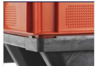
Optional without safety rim