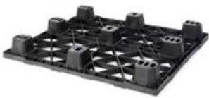
> 9 feet (9F)