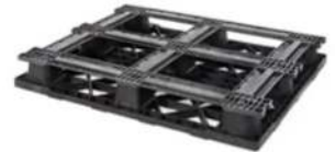
> 6 runners (6R)