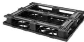
> 5 runners (5R)