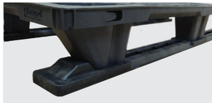
* Skids (optional)