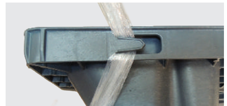
* Special feature designed to enable secure wrapping of goods